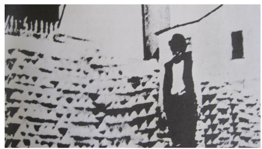
Silver ingots stacked like cordwood at Cartago.